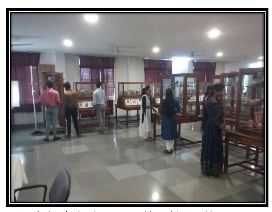
Free sharing of university resources with Local Communities – Museum