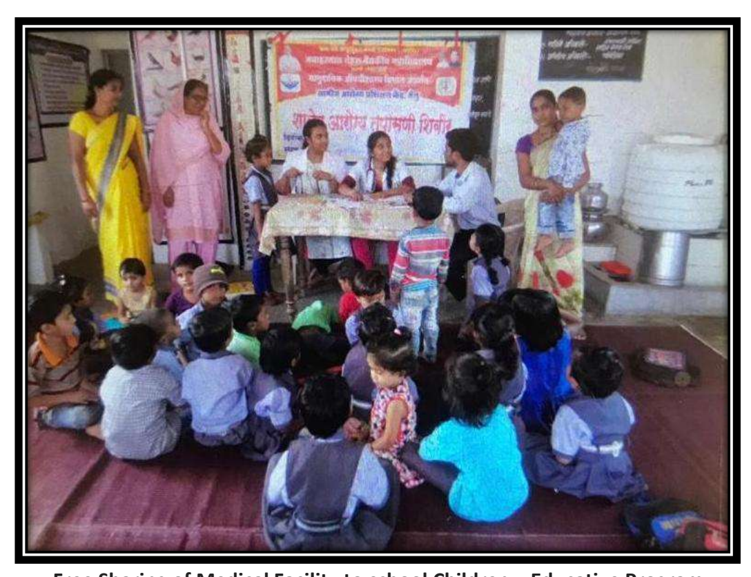
Free Sharing of Medical Facility to school Children – Educative Program