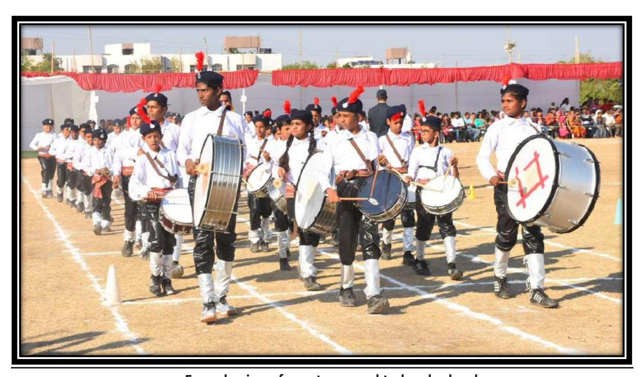
Free sharing of sports ground to local school