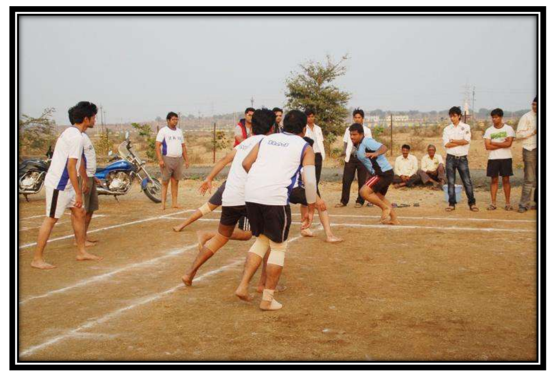
Free sharing of university resources with Local Communities- Sports Facilities