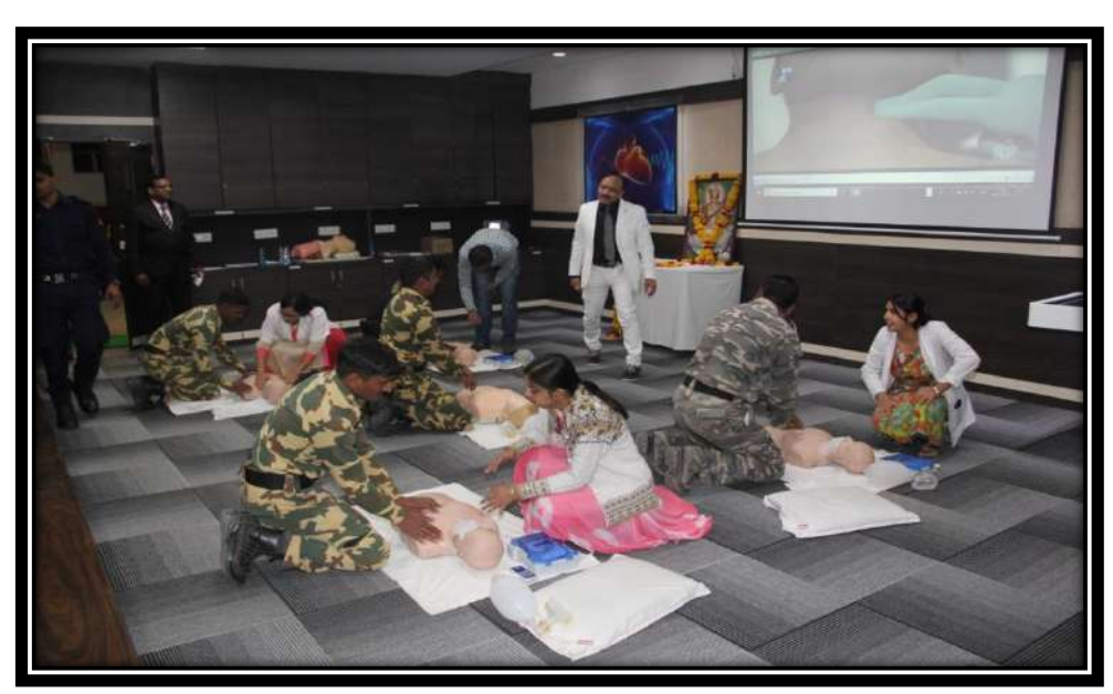
Free training of Cardio pulmonary resuscitation (CPR) for Para-MilitaryPersonnel