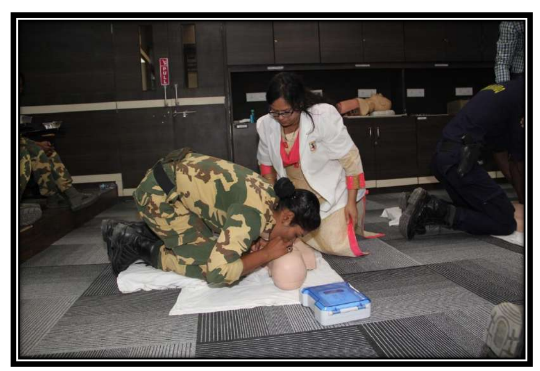
Free training of Cardio pulmonary resuscitation (CPR) for Para-Military Personnel